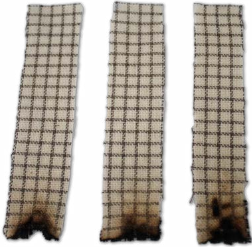
Samples coated with fire retardant layer tested for fireproofing