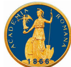
The Romanian Academy, Iași Branch