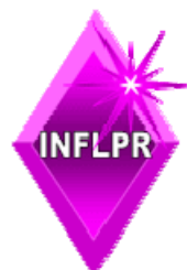
National Institute for Laser, Plasma and Radiation Physics, Bucharest